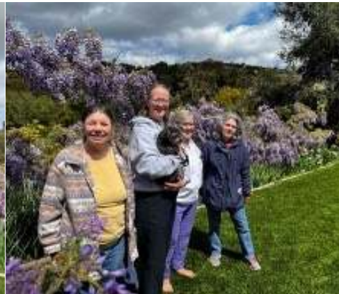
GS Visitors to our ranch...flowers and schoolhouse