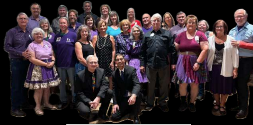
PSDA Anniversary Dance